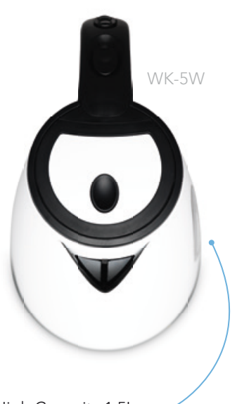
High Capacity 1,5L Boil up to 1,5L water. Transparent elements makes it easy to fill it up to your required amount.

For your safety the kettle shuts itself off automatically when reaching boiling point and when it accidently gets turned on. WK-5B